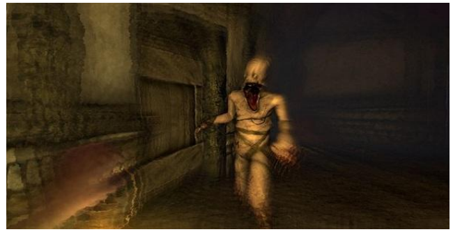
Figure 2: A screenshot from a game of Amnesia in which the player has lost their sanity. The screen becomes difficult to see and the PC difficult to control and keep hidden/quiet, making it easy for enemies much more powerful than the player to find and attack them.

There are other measures, separate from HP, that impact a character's ability to perform actions, which is another way