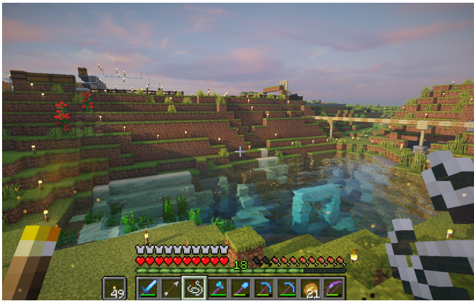
Figure 1: A screenshot from a game of Minecraft , showing a player's partially depleted health bar (hearts) as well as a hunger bar (meat) and armor bar (grey shirts). Both of the latter two affect the health bar.

hit points, boss and player character (PC) design, separate measures of life, status effects, the distinction between being knocked down and being "dead", and the difference between the life of the player and the life of what they control. While we acknowledge that the player's perception during gameplay of life and its vibrancy/fragility/value can be affected by many additional factors such as sound design, camera angles, and narrative, as epitomized by the survival-horror genre (Kirkland, 2011), we have limited our current study to gameplay mechanics only. We do this in the pursuit of opportunities for mechanic innovation as well as what different mechanics say about digital life.